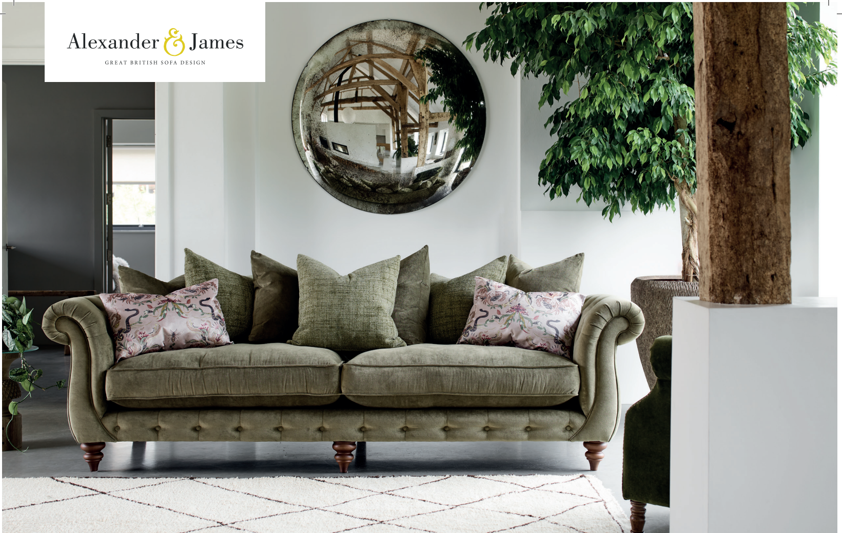
UTOPIA FABRIC 4 SEATER SOFA SHOWN IN AQUA VELVET SAGE FABRIC