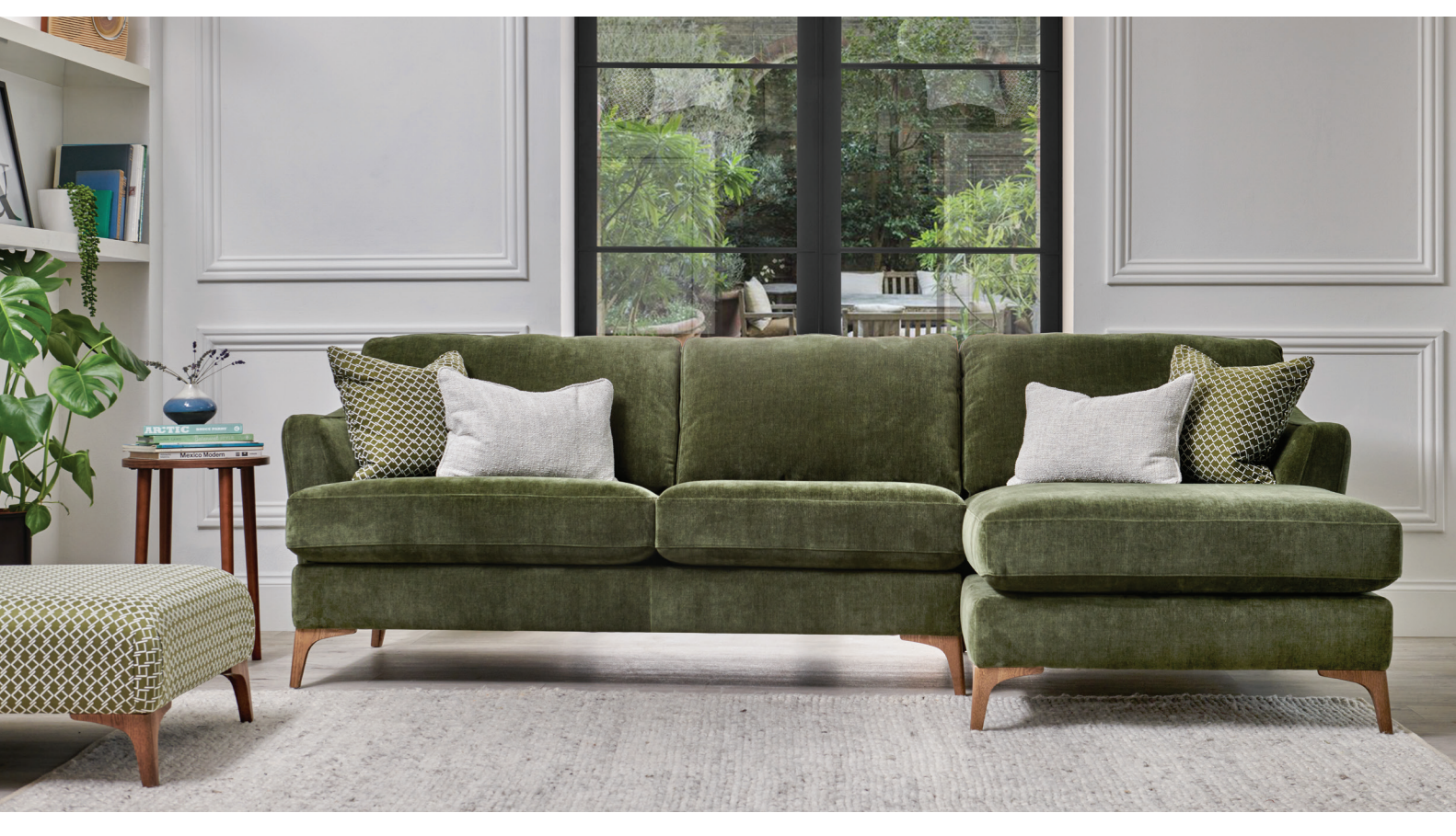
Image shows Left Hand Facing 2.5 seater with a Right Hand Facing Chaise in Manhattan Conifer with Smoke wood feet